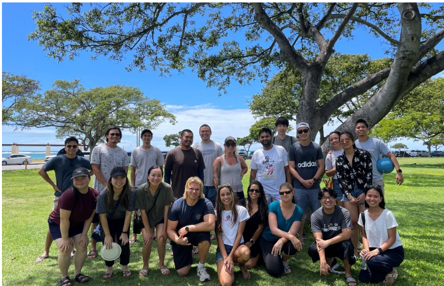
YP BBQ Social Event at Ala Moana Beach Park

We hope that everyone had time to rejuvenate during the past Thanksgiving weekend. The YP section is grateful for our well attended recent events and the exciting opportunities and events ahead of us. We extend our gratitude to everyone who attended our annual BBQ social event on September 17, 2022, at Ala Moana Beach Park. We hope everyone enjoyed playing volleyball, badminton, dodgeball, and Heads Up with us.