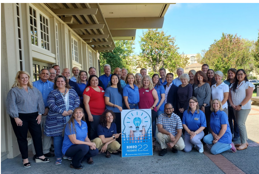
RMSO IV Group

succession planning. The last part of the RMSO included sharing programs, initiatives, and updates from the last year that each Section was the proudest of. It was a great experience to hear what all the Sections in Region IV have accomplished and what their goals are for the future!