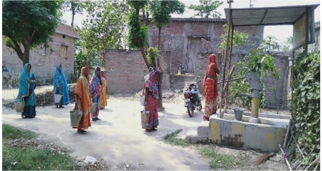
Social Distancing at the community water collection point, Sheohar, Bihar, India