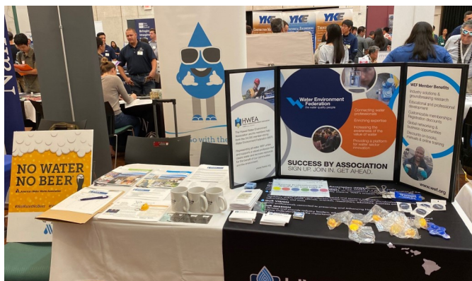
YP booth at the UH career fair.