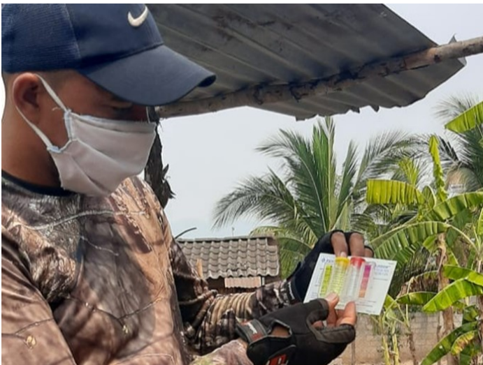
Honduras district technician monitoring the presence of residual chlorine in drinking water