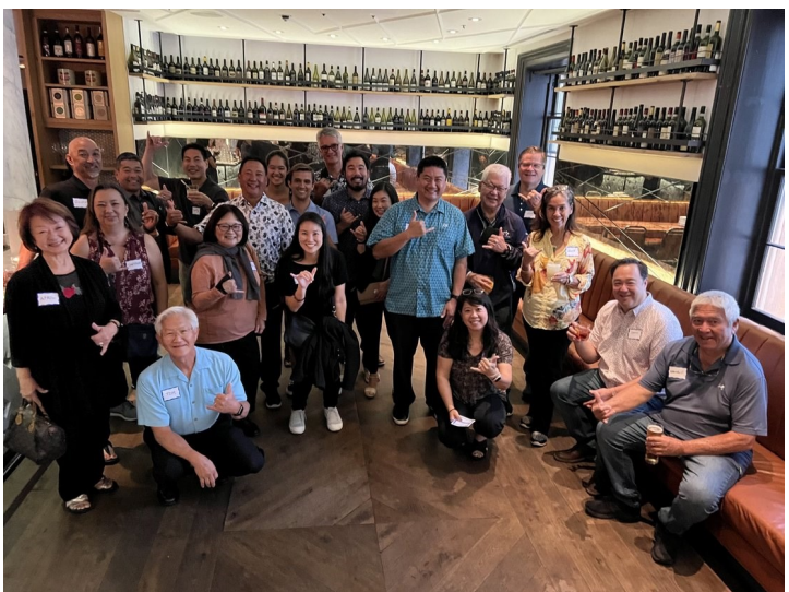
AWWA-HI Section reception at Terroni Adelaide

Present at this year's conference were over 800 utilities with more than 11,500 professionals from over 90 countries. There were a lot of opportunities for networking and visiting up to 450 exhibitor booths, learning from some of the 440 presenters, and watching the 6 different competitions being held.