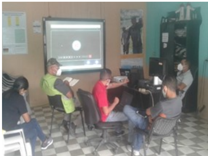
Preparation with district technicians for the Reflection Sessions