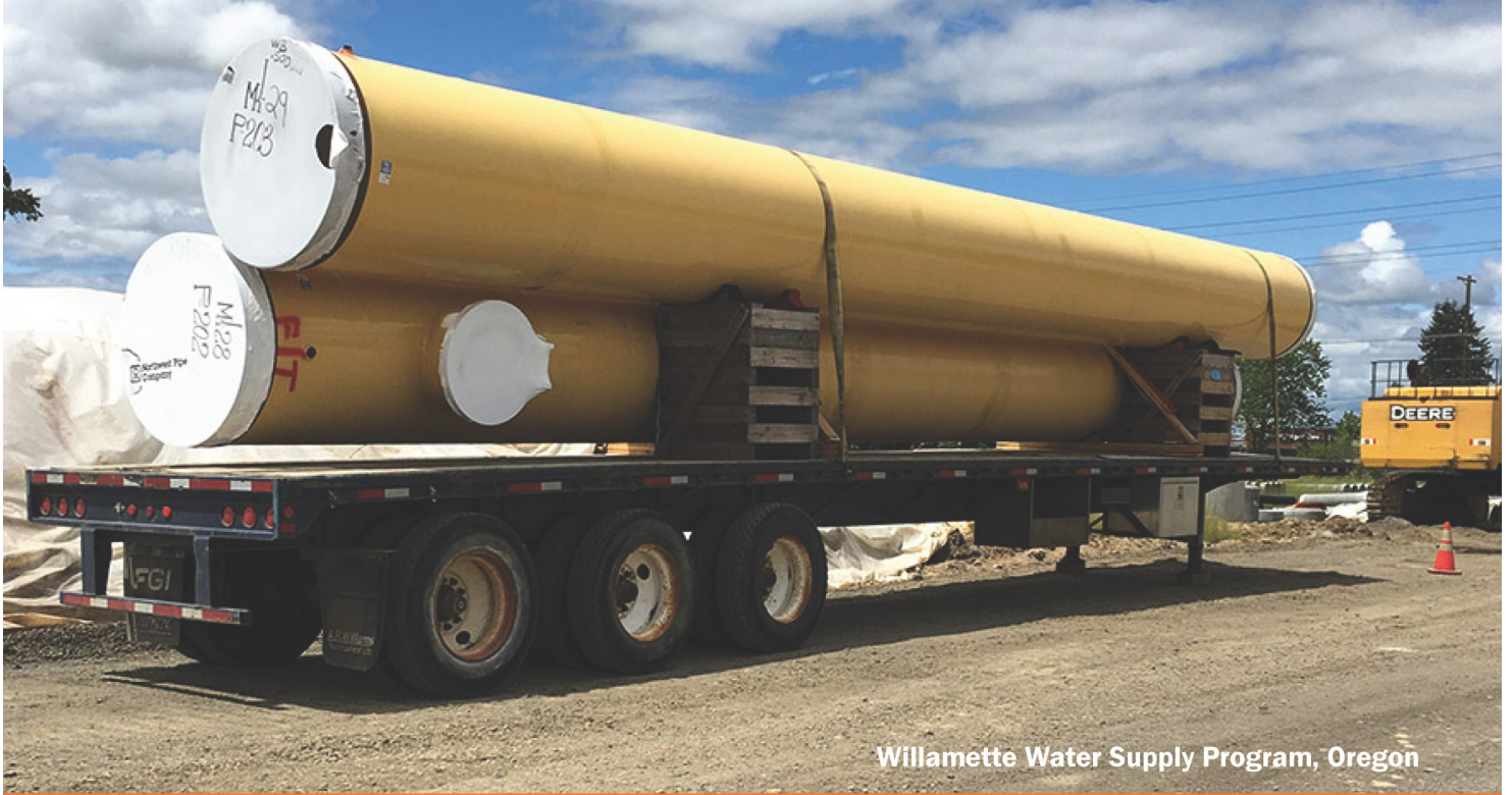
Willamette Water Supply Program, Oregon

Northwest Pipe Company is the largest manufacturer of fully-engineered steel pipe in the United States for water and waste water conveyance. Our national prominence is based on quality, service, and manufacturing to meet performance expectations in all categories including highly-corrosive environments. With a regional sales staff who understand local conditions and regulations, we provide support and prompt delivery to even the most remote job sites. Following our firm-wide values of accountability, commitment, teamwork, and safety, we commit to providing the highest quality pipe in North America.