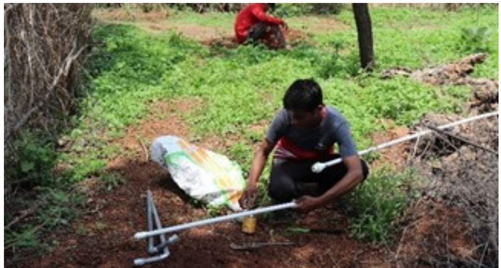
Villagers preparing to lay piping for a new water distribution system in the Amzari village