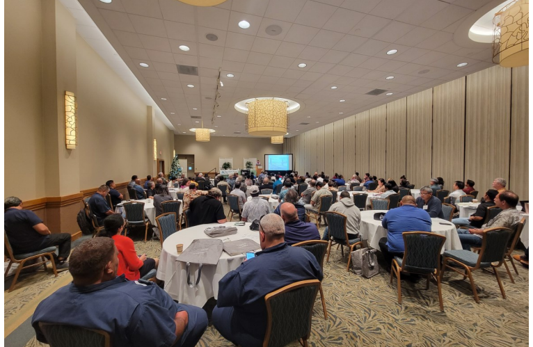
Attendees at the 2022 Water Reuse Conference

T he 13th Biennial Water Reuse Conference was successfully convened on December 7th, 2022 at Ala Moana Hotel on Oahu with 150 registered attendees. Participants included local government leaders, reuse policy makers, reuse community advocates, agriculturalists, water treatment plant operators, researchers, engineers, and consultants. Ten presentations were given by a variety of fantastic speakers, ranging in topic from community-based water reuse implementation to evaluation of on-site and decentralized wastewater treatment systems in Australia. We were fortunate to hear from Water Reuse experts not only from Oahu, but also from California, Arizona, Nevada, and Australia.