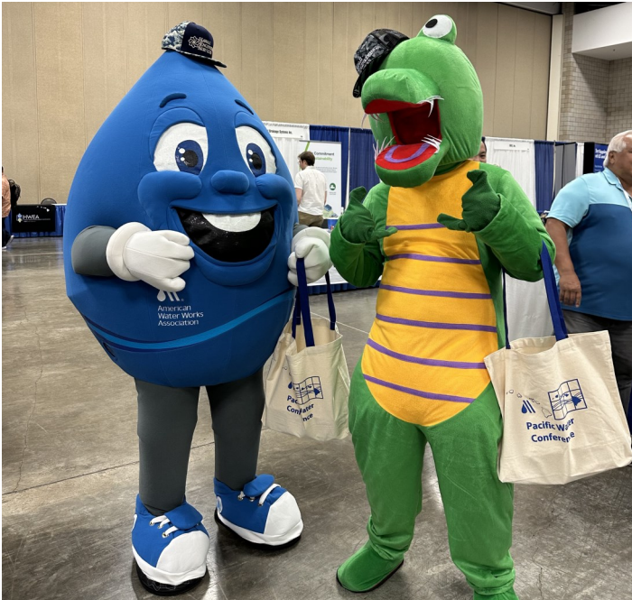
Eddy, the AWWA waterdrop and Niles, the WEF crocodile